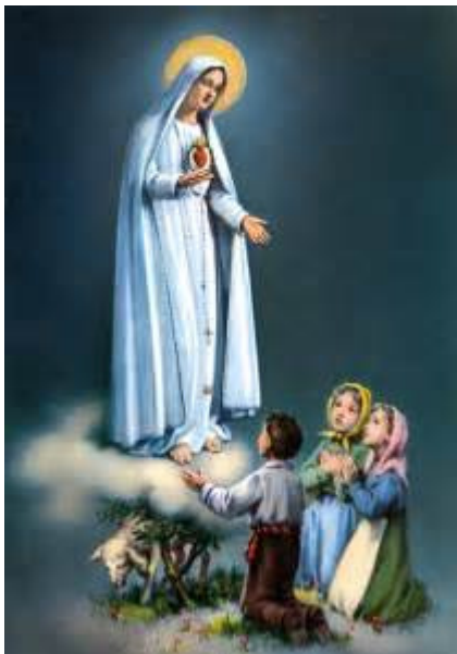
Our Lady of Fatima, May 13th

O God, who chose the Mother of your Son to be our Mother also, grant us that, persevering in penance and prayer for the salvation of the world, we may further more effectively each day the reign of Christ. Who lives and reigns with you in the unity of the Holy Spirit, one God, for ever and ever.